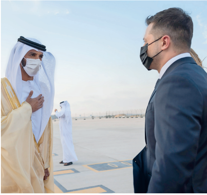
Volodymyr Zelenskyy receives a hearty welcome as he arrives in Abu Dhabi on Saturday on a state visit.

Zelenskyy pointed out to a "successful" example of attracting Emirati investments into the Ukrainian market, which is DP World's operation of a container terminal in the Odessa region in the south of Ukraine.