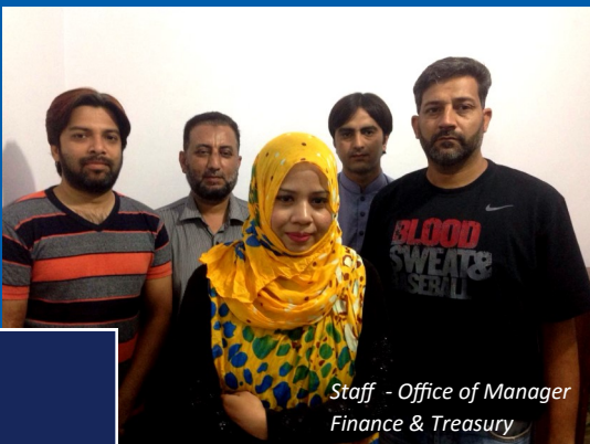
Staff - Office of Manager Finance & Treasury

Existing power crises & future market changes have emerged as a critical organizational diversity in the contemporary business environments. This diversity will define the ability of CPPA-G to meet the requirements, expectations, and preferences of its stakeholders and markets. These goals can only be achieved once CPPA-G builds its capacity to automate its back office operations supported by IT infrastructure.